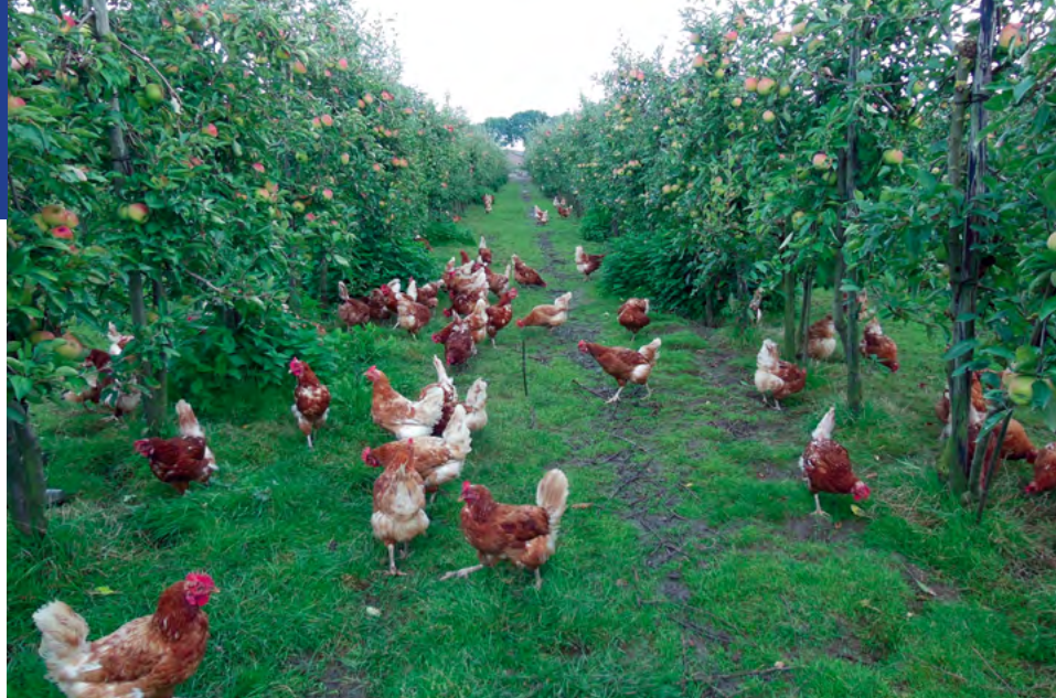
This 1.4 ha orchard in a 2.4 ha free range area provides enough shelter for chickens to travel up to 200m from their base (This picture was taken at 100m). Ref: Louis Bolk Institute