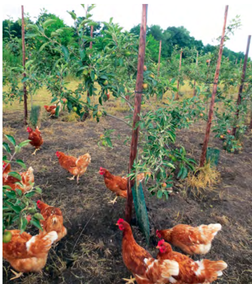
Two year old orchard in free range area Ref: Louis Bolk Institute

A free range area contributes to chicken welfare. However, chickens prefer range areas with shelter provided by trees, bushes or artificial structures. A farm with 10,000 chickens needs a range area of 4 hectares. Planting such a large area with trees is a big investment. Introducing commercial fruit trees is one way to add a valuable revenue stream. Every fruit species has particular needs and some will require additional investment. For example, cherry trees require netting for protection against birds. This leaflet explains the requirements of incorporating apple trees into a free range poultry system.