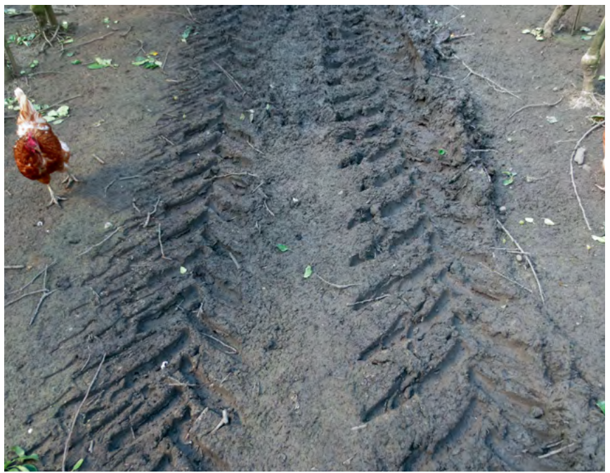
Close to the chicken house the soil condition is compacted and wet due to chickens. Compaction of the soil by machinery will also impair tree growth and apple production. Ref: Louis Bolk Institute

Apple trees need loose dry soil, therefore, conditions can be very challenging for apple trees growing near to the chicken house. In this area, it is more appropriate to plant cheaper and more robust species or rootstocks with more growth potential. In a range area, bigger and older trees, than those which would be suitable for an orchard without chickens, need to be planted. It is sensible to plant 2-3 apple varieties, since they may react differently to seasonal changes and the presence of the chickens.