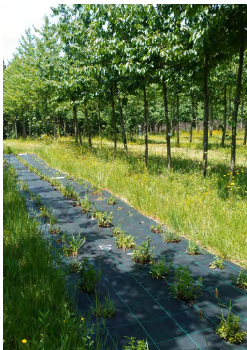
Melissa officinalis L. plants under cherry trees with plastic mulch.

Melissa officinalis L. (commonly known as lemon balm in English) is used to supply rosmarinic acid to the pharmaceutical sector. Melissa officinalis L., like many medicinal plants, is well adapted to partial shading. Cherry trees are a high value timber tree with good economic return. They generate little shade compared with other trees.