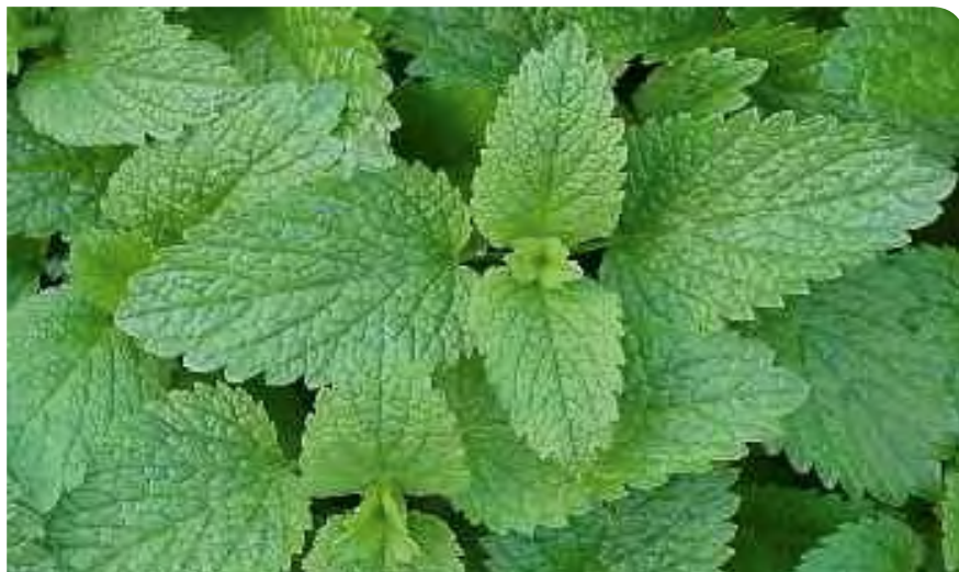
Leaves of Melissa officinalis L. before flowering