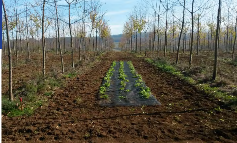
Melissa officinalis L. plants under cherry trees at the beginning of the spring.