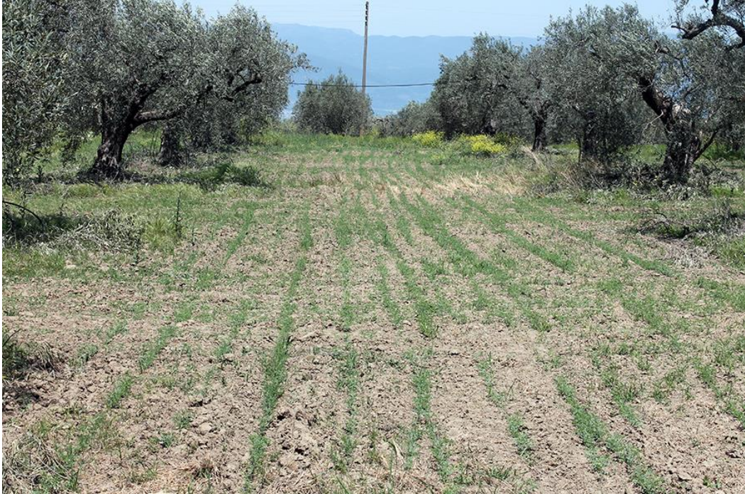
Figure 1. Intercropped area in an olive grove