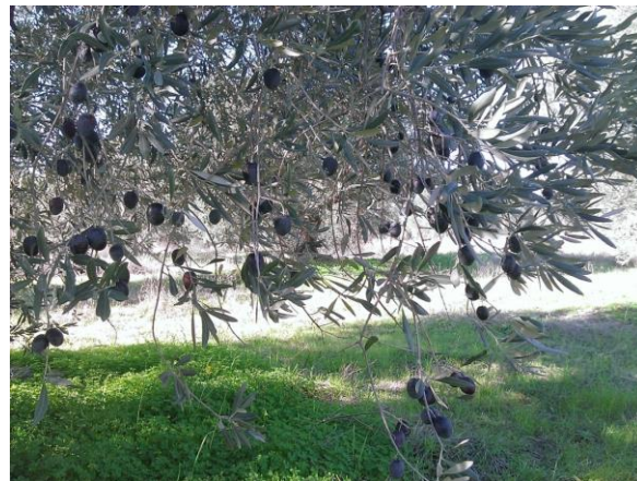
Figures 3 and 4. Intercropped area in an olive grove in Molos, Central Greece and the production of olives