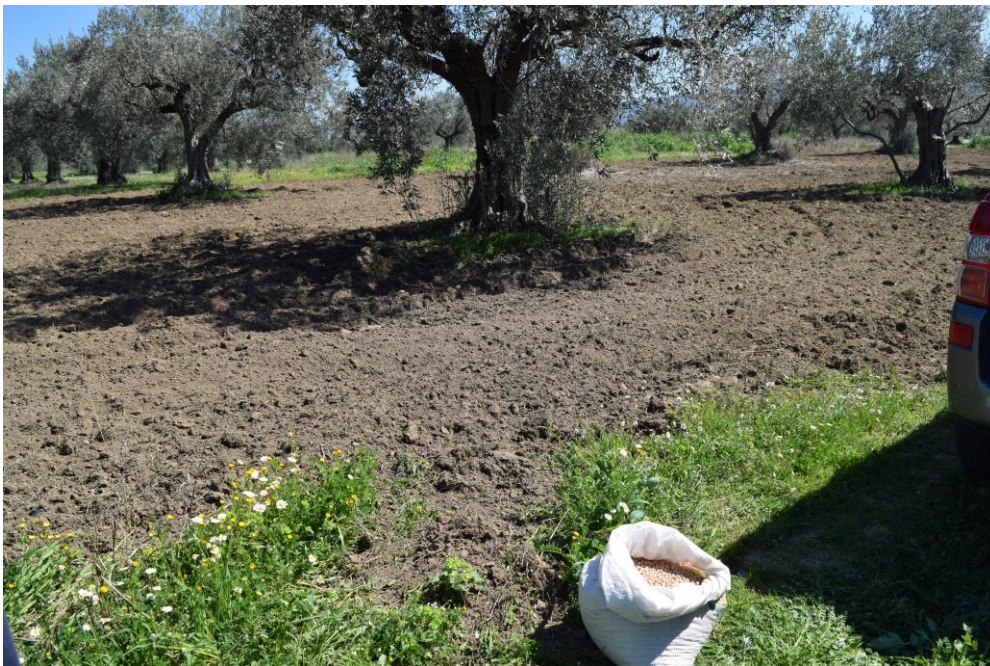
Figure 6. Chickpeas were sown in the trial at Molos, after ploughing, on 24 March 2017

Phosphorus: the mean P (ppm) at the shallow depth was significantly larger than the one in the deeper soil ( F = 4.012 , p = 0.047 ). The mean P (ppm) in the area with no intercrop was significantly greater than that in the area with chickpeas ( F = 18.574 , p < 0.001 ). The mean P (ppm) at a shallow low depth was significantly greater than that in the deeper soil ( F = 52.119 , p < 0.001 ).