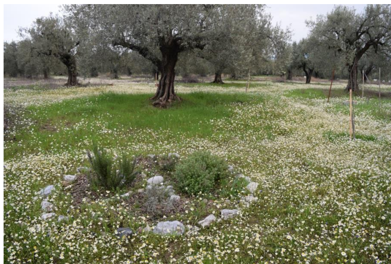
Figures 1 and 2. Looking South-East along the tree rows (left) and some aromatic plants already planted in the orchard (right) (27 March 2015).

Trees in the orchard were at least 60 years old and approximately 5 m in height. The lower edge of the canopy was about 1.6 cm from the ground. The field was not fenced as there was no need for protection. The chickpea was a choice to improve soil chemical properties and, hopefully, nitrogen economy of the tree. Similarly, the introduction of an aromatic herb such as oregano was a popular request to test from the participants of the stakeholders meeting. Further details are given in Table 2.