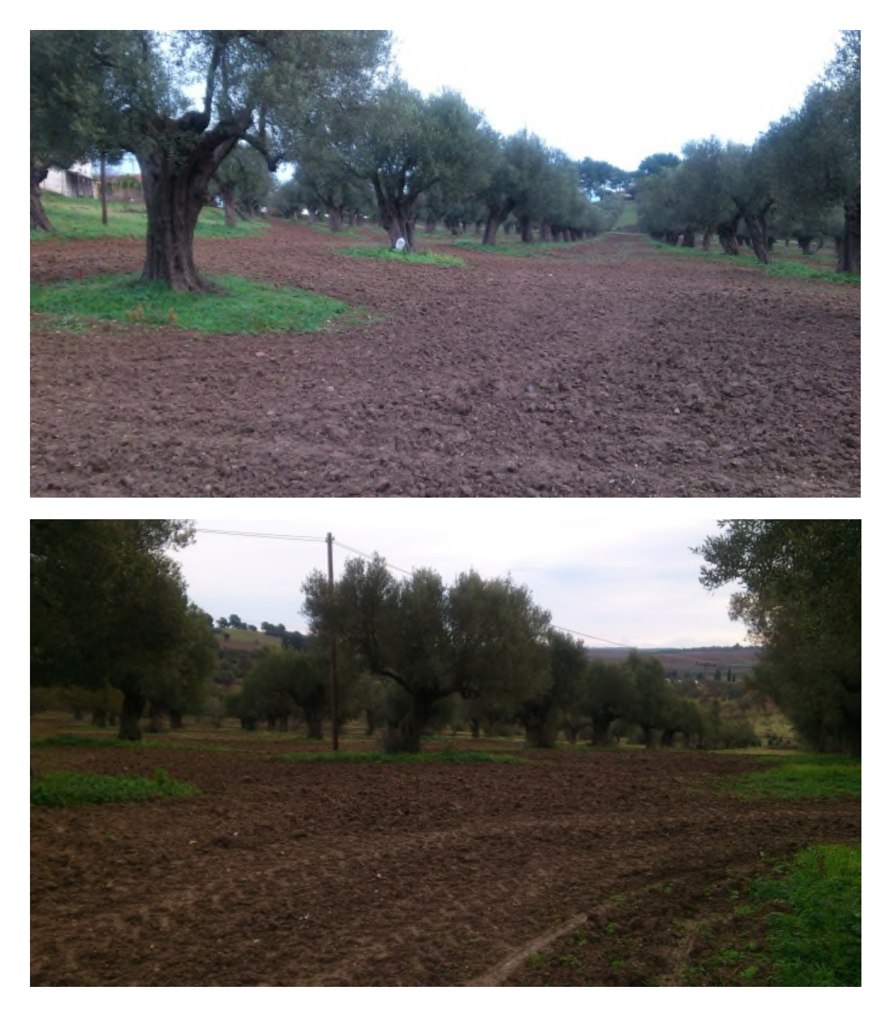
Figure 2 and Figure 3. View of the experimental plots before seeding in December 2014