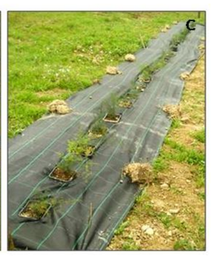
Figure 1. Experimental plots at Colle Cecco: a) olive-asparagus system in high density system, b) olive-asparagus system in a traditional system and, c) asparagus as a control. The tulips and narcissi have not been planted yet.