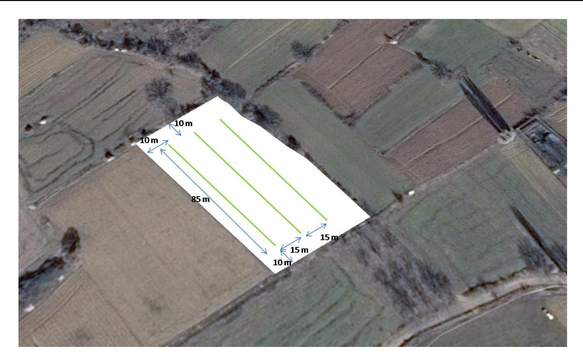
Figure 2. Aerial photograph showing the layout of the walnut-bean system