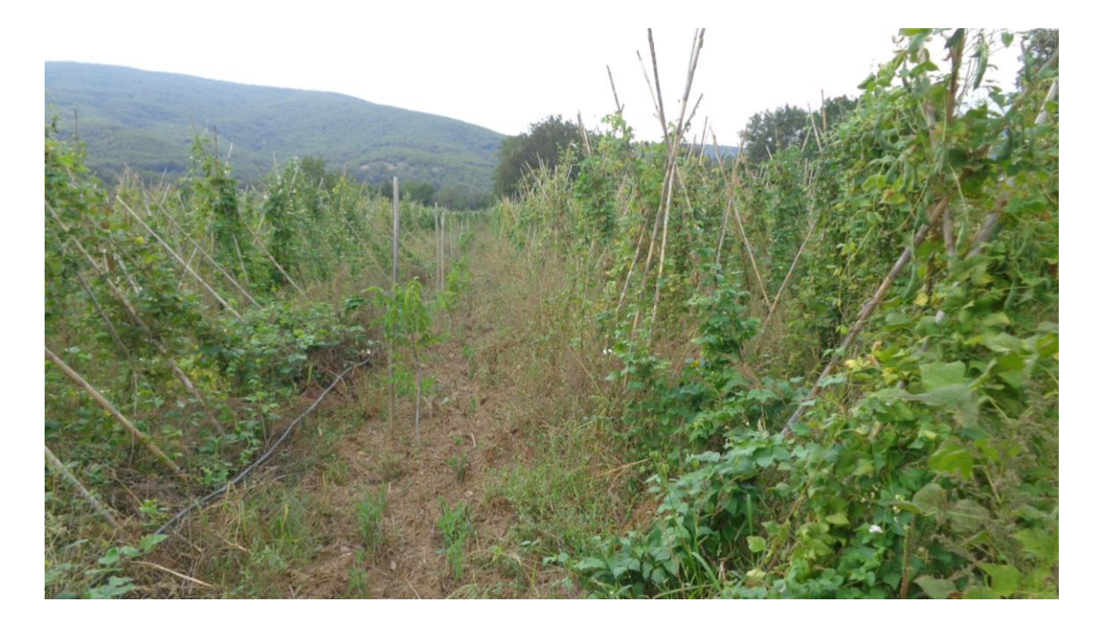
Figure 1. Planting of beans between walnut