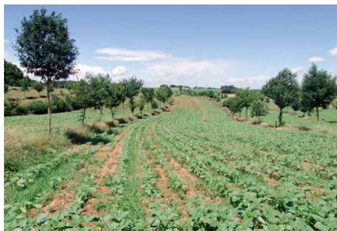
Planting a mix of species on contour lines has a great impact at the landscape level

In temperate systems tree lines should ideally run North – South, so the crops will be less affected by the shade and any shading will be equal on both sides of the runs. Of course this will be influenced by other factors such as the orientation of the field and the slope. On steeper ground trees should be planted along contour lines to reduce erosion. The tree rows should not interfere with drainage ditches. In windy areas it is better to arrange tree rows in parallel with the main wind direction. An area with no trees should be maintained at the end of each line (head-lines) to allow machines turning around them. In addition, trees should not be planted under an electric or telephone wires crossing the plot.