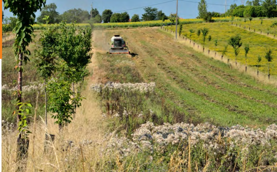
The distance between the tree lines is a multiple of the largest engine working width, this to avoid the overlaps.